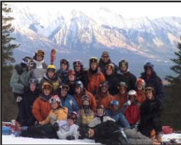
Barff Alpine Camp