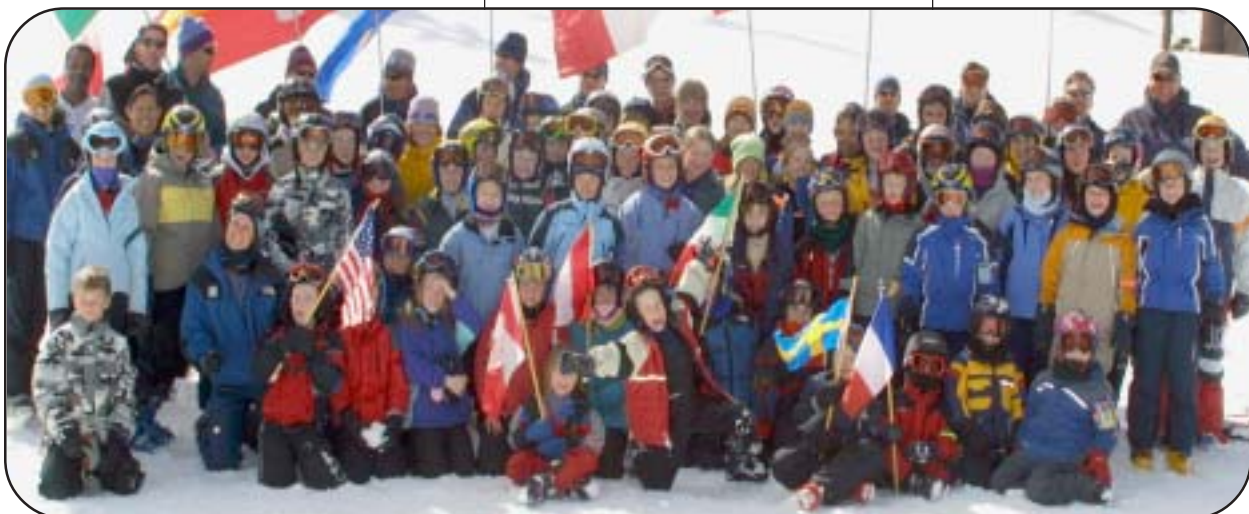
(MBSEF Mini World Cup Team)

Solomon GS World Cup Skis , 185 cm., never used. $350 OBO. Call Del Greenleaf 389-2862 (home), 317-5533 (work), 480-5558 (cell).