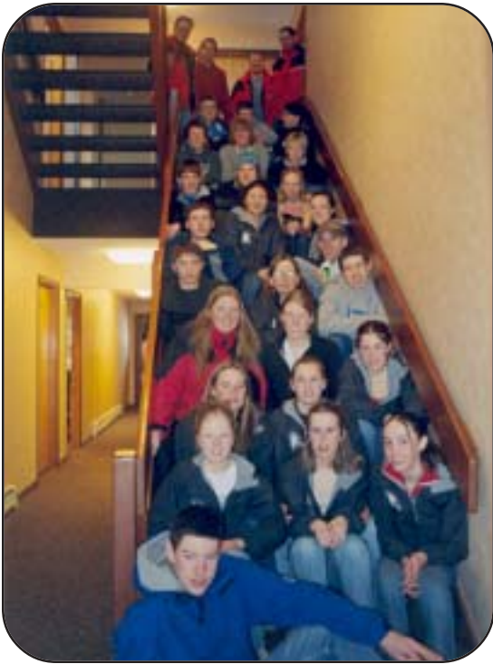
(2003 PNSA XC JO Team, Fairbanks, Alaska)